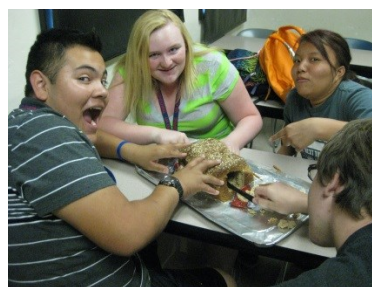
“Under The Earth”: creating a drift through sliced bread.